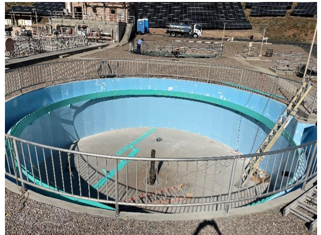
Moosa Clarifier #1 Upgrade Project